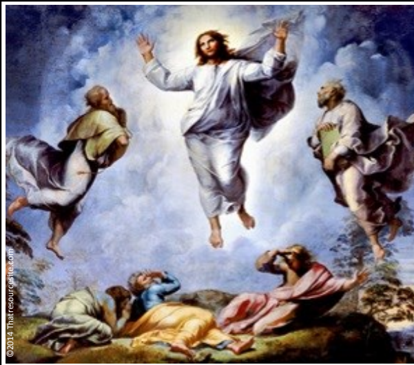
The Fourth Luminous Mystery The Transfiguration