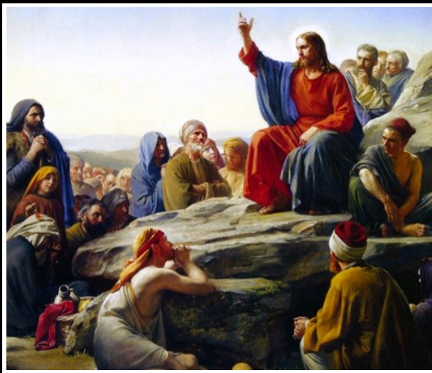
The Third Luminous Mystery The Proclamation of the Kingdom